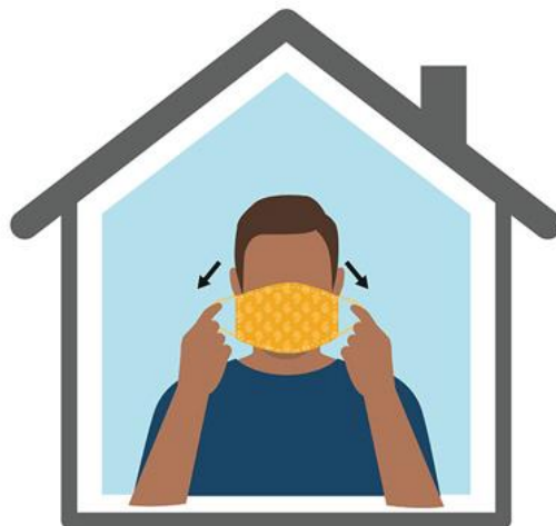
Take Off Your Mask Carefully, When You Come into School